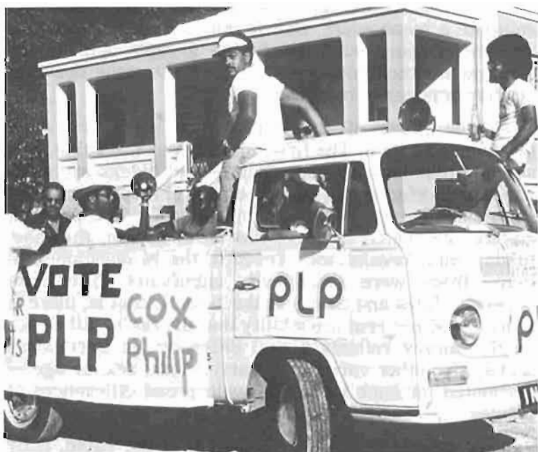
PLP sound truck tours neighbourhoods in Sandys, a parish where the party gained an additional seat in 1976.

The comparison of UBP whites, UBP blacks, and PLP blacks enables us to see whether race or party plays the dominant role in shaping social thought. The data for the fourth group, PLP black converts, enable us to monitor which issues were most significant in winning new supporters to the PLP.