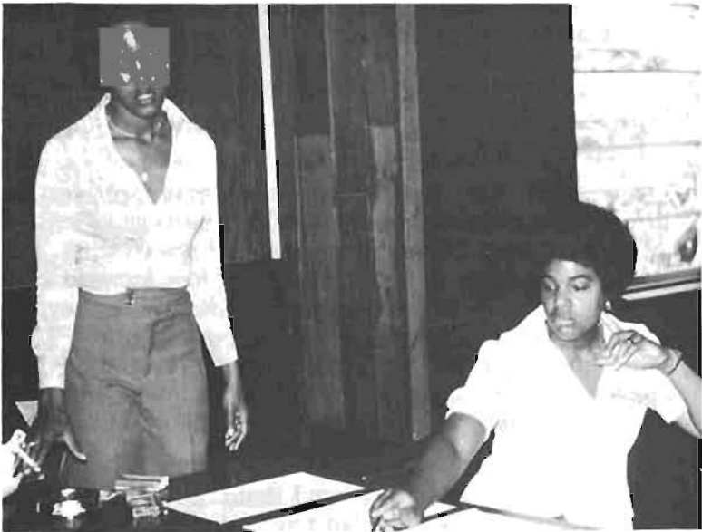
Working from polling day headquarters in the lounge of a black workmen’s club, PLP volunteers check voters’ list.

But the politicization process involves more than the conscious efforts of politicians and parties to “educate” the people. It has a life of its own in the black workmen’s clubs, voluntary recreational and beneficial associations that have become political nerve centers and settings for informal discussion and rapport-building exchange between politicians and working-class blacks (Manning 1973). Although the clubs are nominally neutral in partisan politics, the 1976 election saw two club presidents endorse the PLP and several other clubs place their premises at the disposal of the PLP for rallies and polling day headquarters. Mindful of the club constituency, the UBP has reacted by confidentially declaring the clubs a major