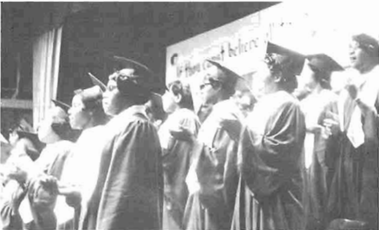
Women's choir at the New Testament Church of God, Bermuda's largest Pentecostal assembly. The ideological conversion of black women to the PLP is the outstanding aspect of Bermuda's political ferment.

On closer inspection it would appear that cultural factors hold an intermediate position in the causal sequence of divorce. The better educational qualifications of women than men — particularly among blacks — enable wives to secure higher status and often better paid and steadier jobs than their husbands (Census 1970: 99-101). Their salaries, moreover, are considered their own, as black Bermudian spouses tend to keep separate bank accounts and maintain strict secrecy about their own assets. The financial independence of wives encourages psychological independence and the demand for equal privileges — including the taking of outside lovers, traditionally a male prerogative. Paul (1977: 141) reports a case, not exceptional, where a working black wife and mother carried on an extramarital affair simply to even the score after learning that her husband had a “ladyfriend.” A variation of this scenario is commonplace in the black workmen’s clubs, which in the past decade have become increasingly accessible to women, most of them separated or divorced (Manning 1973: 162-166).