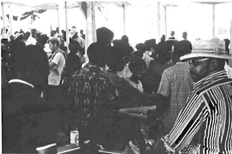
Gamblers mill around Crown and Anchor tables at a club sports event. The PLP's conservative moral stand on gambling is supported by black women but rejected by black men.

Gambling in the more conventional sense is both a prevalent activity and an organizing metaphor in black Bermudian culture. The workmen's clubs regularly run bingo games, card games, and raffles. At club-sponsored sports festivals like Cup Match and County Games there is found the "stock market," a huge tent for the popular dice game of Crown and Anchor, as well as other tables for cards and crap rolling. The clubs have revived horse racing and are the principal venues for betting on local sports events contested by their teams. The ongoing influence of such activity encourages clubgoers to view their lives as a game of both skill and chance, best played by