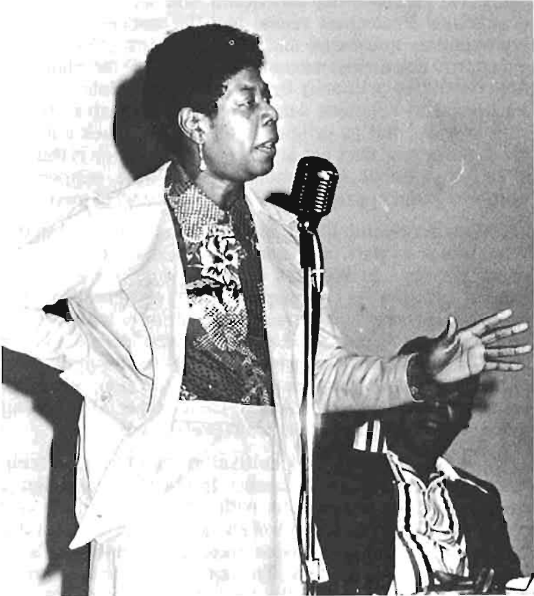
PLP leader Lois Browne talks to a party gathering.

But after two frustrating defeats at the polls, the party decided not only to mute its controversy with the churches but to move in the opposite direction by aligning itself with religious elements. The new strategy was unveiled in the 1976 election campaign when a single issue — the integrity of family life — was made the focal point and integrating