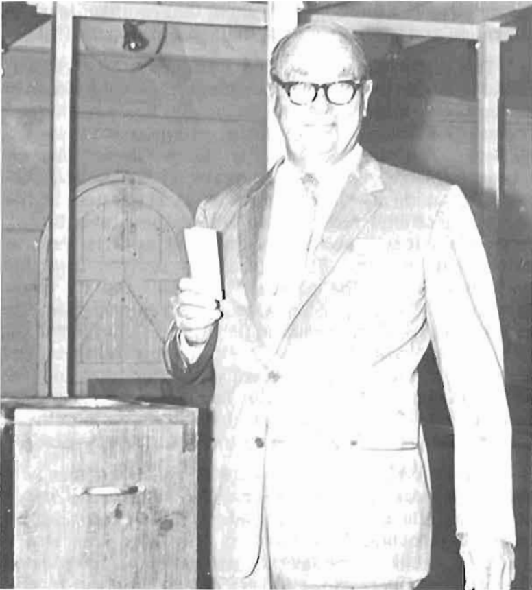
Sir Henry "Jack" Tucker, UBP architect and parliamentary leader from 1964 to 1971, votes in Bermuda's first election under full and equal adult suffrage in 1968.

Besides the influx of expatriate expertise there has been considerable economic advancement among groups