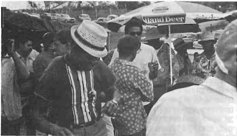
Black men enjoy the ambience of a workmen's club festival. Men 'compete' to boost the PLP's voting strength, but women have been ideologically converted.

On the white side, by contrast, men and women are moving in the same political direction — a direction of growing attrition from the UBP, growing uncertainty, and slight but growing agreement with the PLP (Table 3-9). As noted in the discussion of Table 3-6, the major difference between the sexes lies in the greater political uncertainty of women — a difference that is most marked in the two youngest cohorts. Otherwise, the chief finding